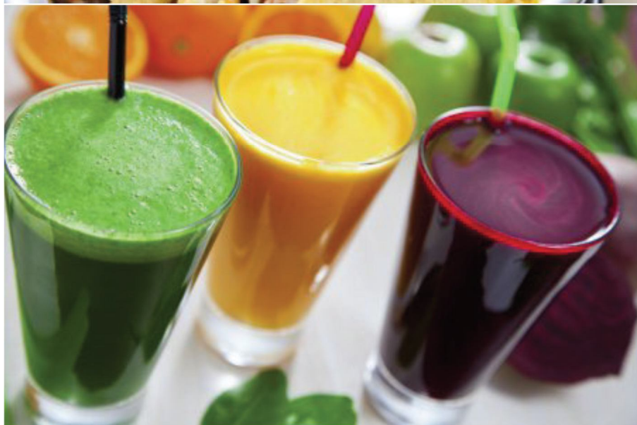
Fig. 1.3: Common things we eat and drink